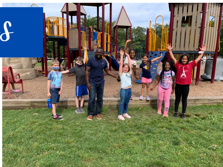
1ST GRADE CLASS END OF YEAR MEET & GREET 2021 - HOSTED BY PARENTS