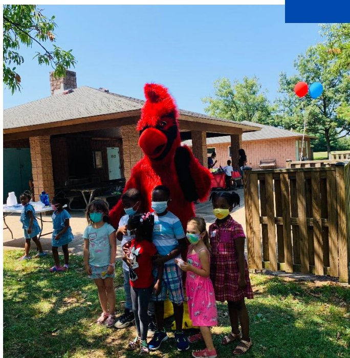
PTA KINDERGARTEN & FIRST GRADE MEET & GREET 2021

Prince George's County Memorial Library System is offering free help to our children. Below, you'll find just some of the many resources and services that the Library provides students to help make sure they excel in school!