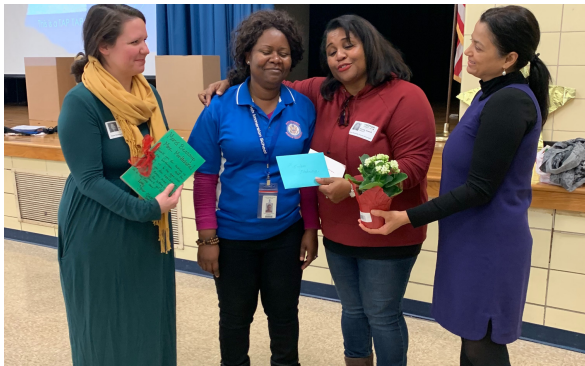
PARENT PRESENTATION DURING TEACHER APPRECIATION WEEK 2020