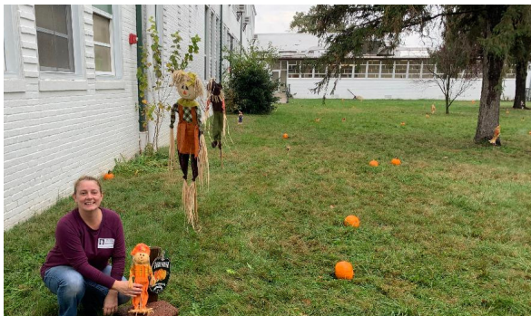
PARENT VOLUNTEER SETTING UP DURING DKFI PUMPKIN PATCH 2019