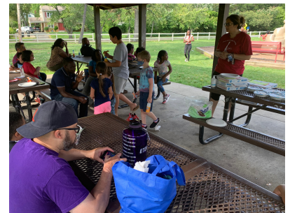
END OF YEAR MEET & GREET 2021