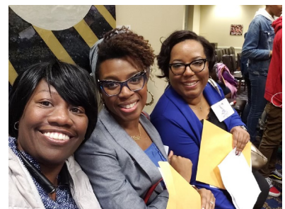
PTA LEGISLATIVE CO-CHAIRS ADVOCATE FOR BLUE PRINT FOR MARYLAND SCHOOLS AT MD STATE CAPITOL BUILDING IN 2019