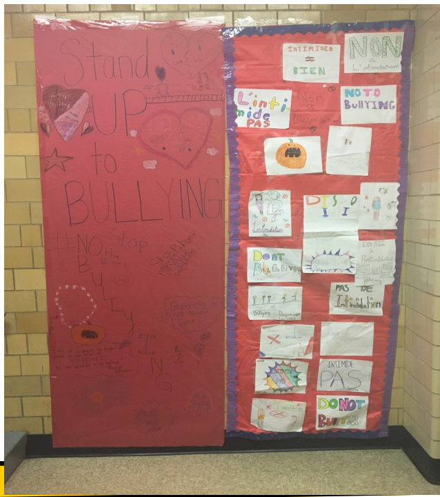
Signs of Compassion